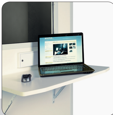
Folding table and connecting