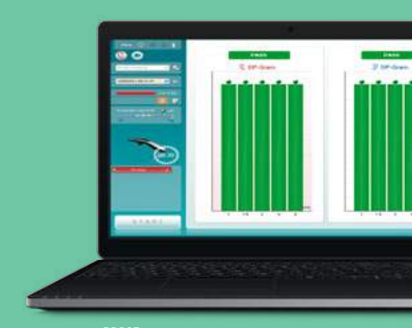
DPOAE440 DP-Gram with a PASS in bar view