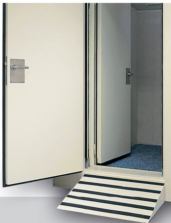
DW internal with double door