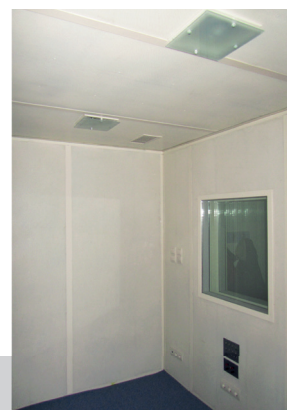
Internal view in perforated steel