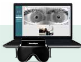
VisualEyes 505 Video Frenzel