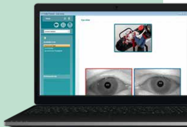
The TRV Chair works via VNG software from Interacoustics (VF405, VisualEyes 515 or 525)

Due to registration requirements the TRV chair may not be available in your market at present. Please contact your local Interacoustics representative for information about availability.