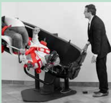
The TRV Chair is a unique tool for diagnosing and treating BPPV

Diagnosing heavy patients, disabled patients, elderly patients or patients with a history of neck issues has always been a challenge when applying manual tests such as the Dix-Hallpike