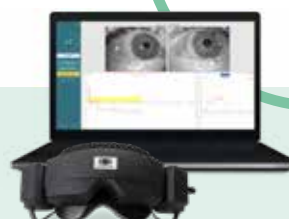
VisualEyes 525 Complete VNG solution for balance assessment