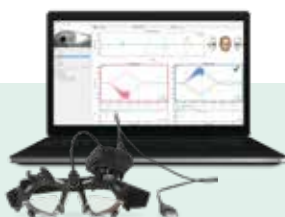
EyeSeeCam vHIT Video Head Impulse Test